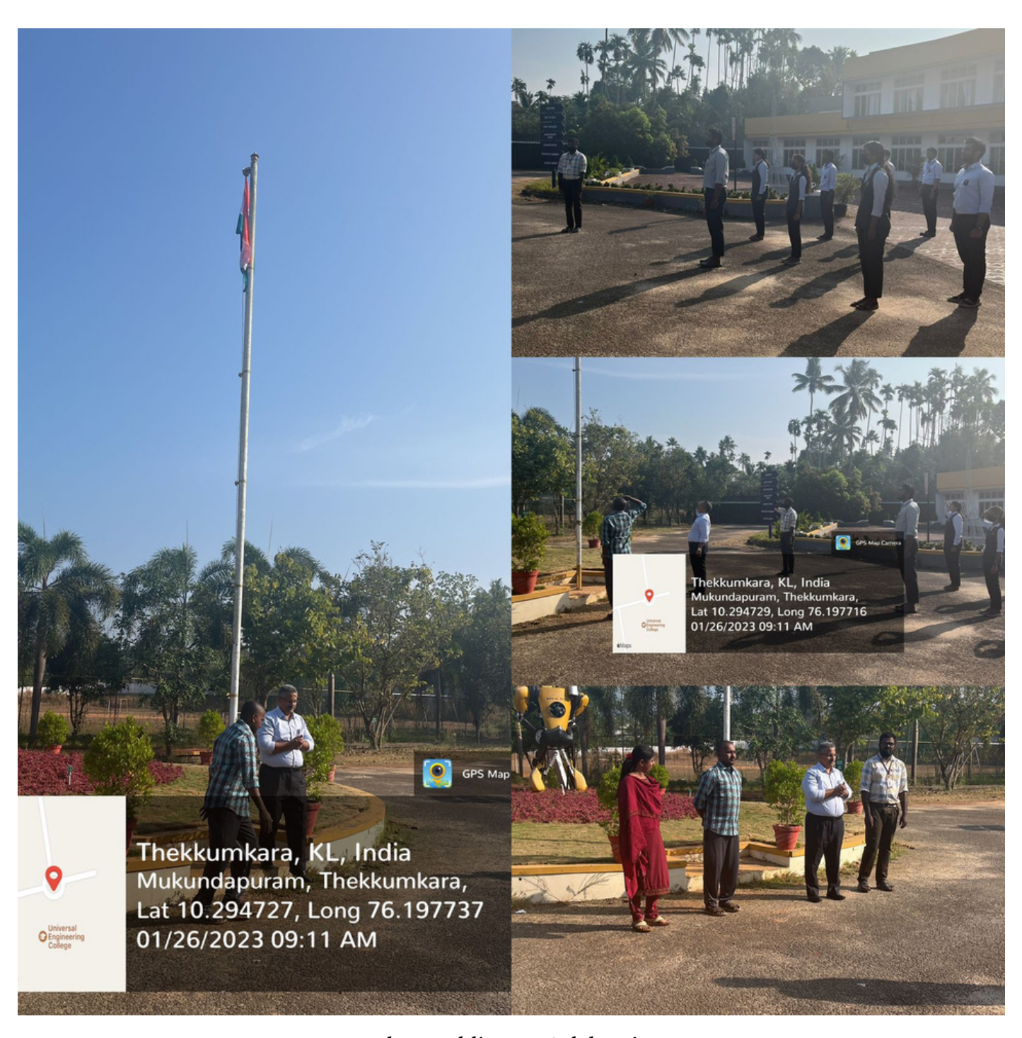
74th Republic Day Celebration