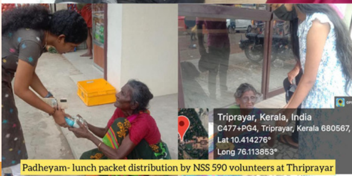
Padheyam- lunch packet distribution by NSS 590 volunteers at Thriprayar