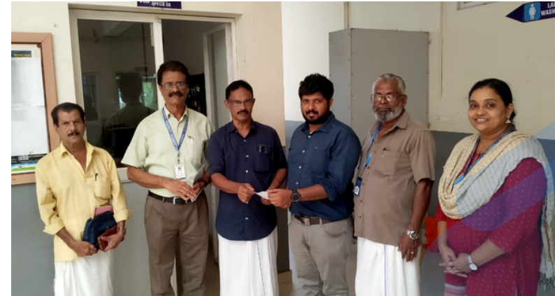
UEC Alpha Palliative care charity box collection ASH, CE, ME, CSE AND RECEPTION