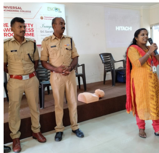
Encon club in association with Department of Kerala Fire and Safety Services organized a one day training programme on Fire and Safety on 23rd April 2022 at 11 am.